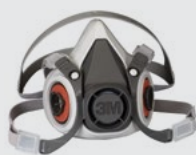
6000 Half Face