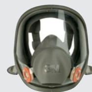
6000 Full Face